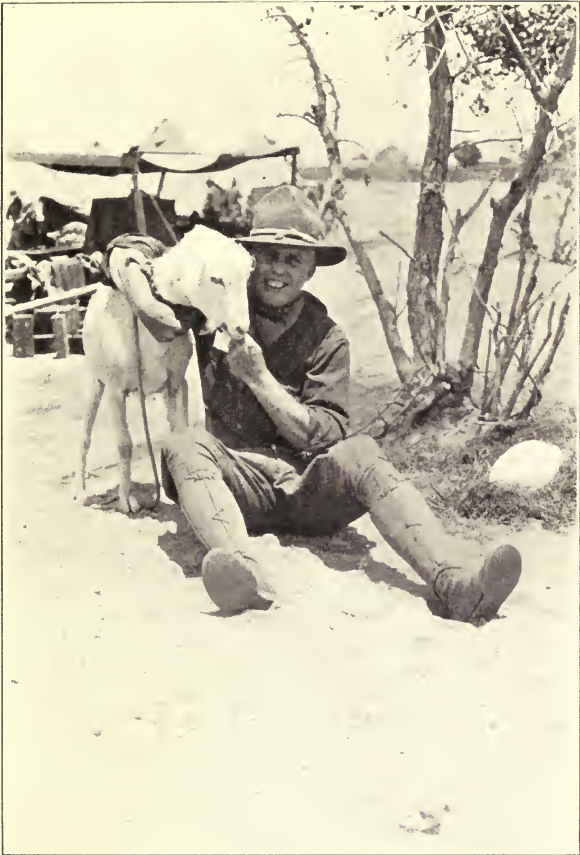
BILLY, OF THE MASCOT ARMY